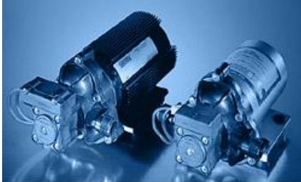
Premium Pump w/ cooling fins Standard