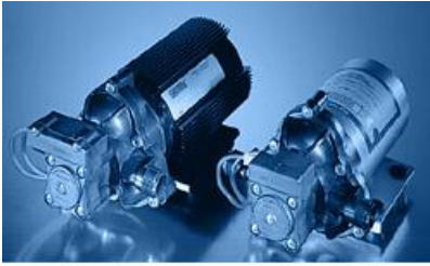
Premium Pump w/ cooling fins Standard