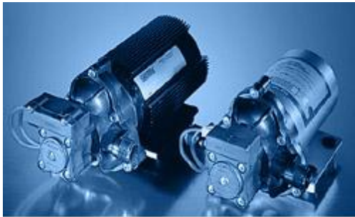
Premium Pump w/ cooling fins