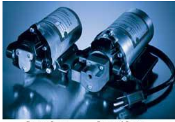
Bypass Pump Demand Pump